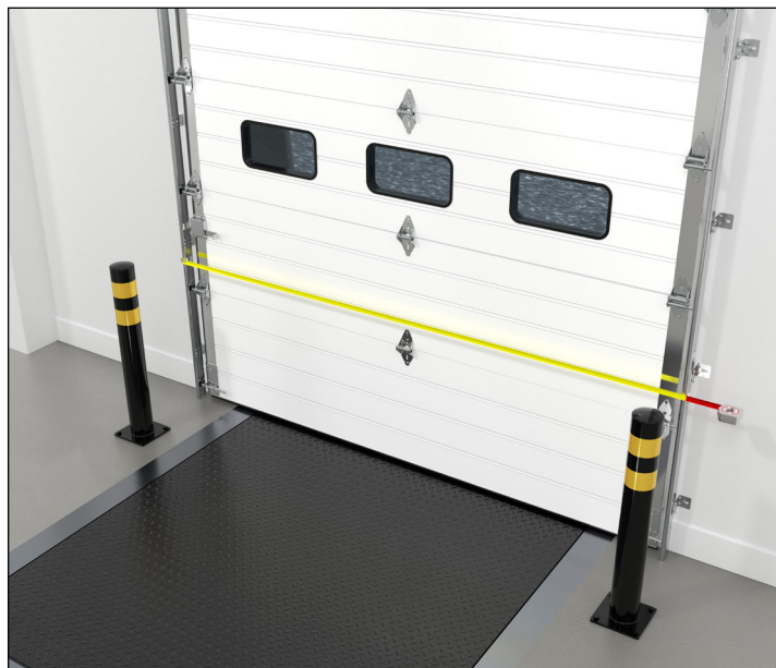
2 Outside to outside of existing track To ensure a proper fit with your door.