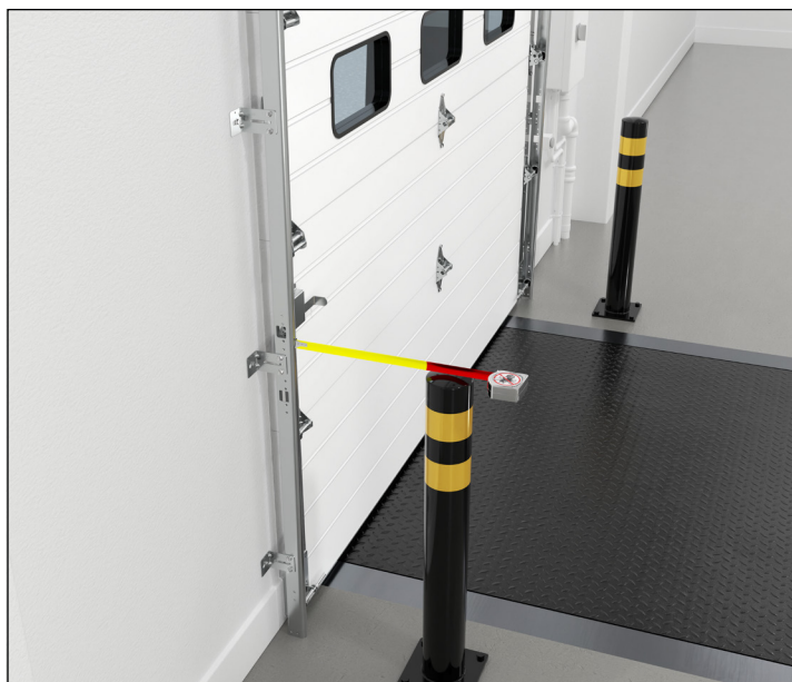
1 Track to bollard To make sure you have clearance for your Rasco door.