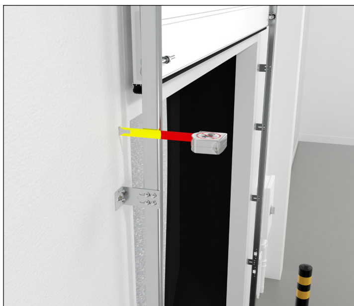
3 Distance from wall to furthest part of existing track at top of the opening To ensure a proper seal on the sides, many tracks are farther away from wall at top of opening.